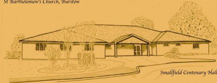
Smallfield Centenary Hall